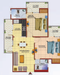
BLOCK-B 3BHK+KITCHEN+STORE+ 2 TOILET+UTILITY BALCONY SUPER AREA - 89.00 SQ.FT.