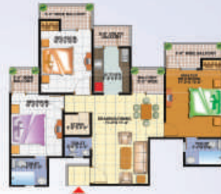
BLOCK-A 3BHK+KITCHEN+STORE+ 2 TOILET+UTILITY BALCONY SUPER AREA - 120.00 SQ.FT.