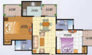
BLOCK-B 3BHK+KITCHEN+STORE+ 2 TOILET+UTILITY BALCONY SUPER AREA - 89.00 SQ.FT.