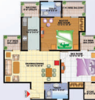
BLOCK-C 3BHK+KITCHEN+STORE+ 2 TOILET+UTILITY BALCONY SUPER AREA - 115.00 SQ.FT.