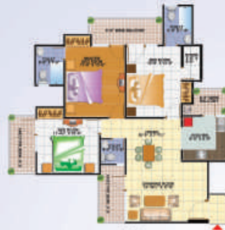
BLOCK-A 3BHK+KITCHEN+STORE+ 2 TOILET+UTILITY BALCONY SUPER AREA - 120.00 SQ.FT.