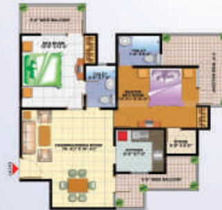
BLOCK-C 3BHK+KITCHEN+STORE+ 2 TOILET+UTILITY BALCONY SUPER AREA - 115.00 SQ.FT.