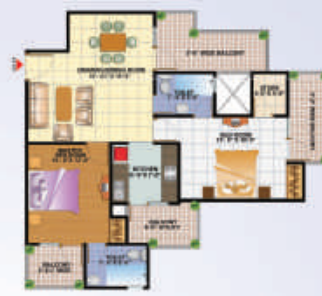
BLOCK-C 3BHK+KITCHEN+STORE+ 2 TOILET+UTILITY BALCONY SUPER AREA - 115.00 SQ.FT.