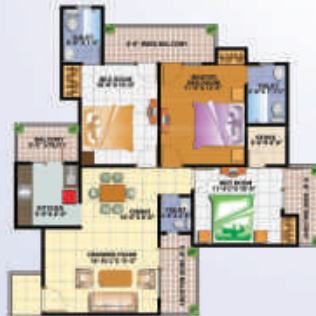
BLOCK-A 3BHK+KITCHEN+STORE+ 2 TOILET+UTILITY BALCONY SUPER AREA - 120.00 SQ.FT.