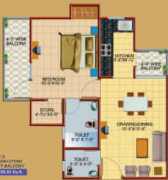
BLOCK-D 2BHK+KITCHEN+STUDY & TOILET+TV+BALCONY ELEVATED FLOOR (SEE 13/20)